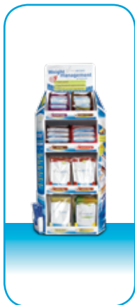
Code: PRESLI00501 380mm (w) 910mm (h) 195mm (d)