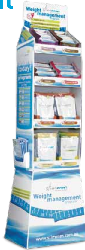
Code: PRESLI00502 (Includes base) 500mm (w) x 1310mm (h) x 260mm (d)