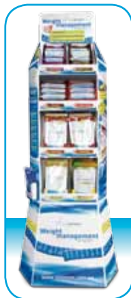
Code: PRESLI00502 (Includes base) 500mm (w) 1310mm (h) 260mm (d)