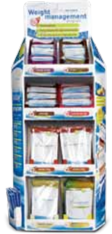
Code: PRESLI00501 380mm (w) x 910mm (h) x 195mm (d)

► From the makers of Celebrity Slim® & The Biggest Loser®