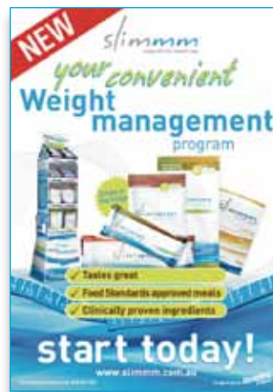
A2 Poster 594mm (h) x 420mm (w)