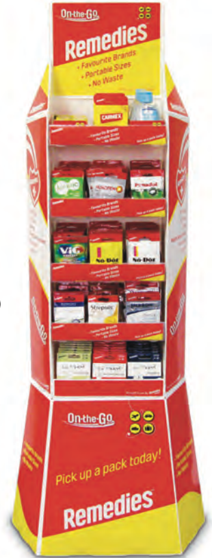
Code: PREREM00502 (Includes base) 500mm (w) x 1310mm (h) x 260mm (d) For Prepack contents see back.