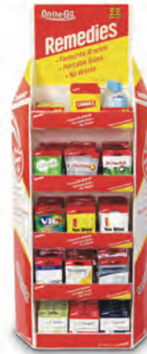
Code: PREREM00501 380mm (w) x 910mm (h) x 195mm (d) For Prepack contents see back.