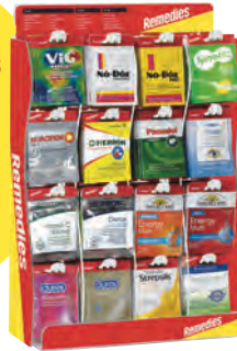
Code: PREREM00503 370mm (w) x 520mm (h) x 190mm (d) For Prepack contents see back.